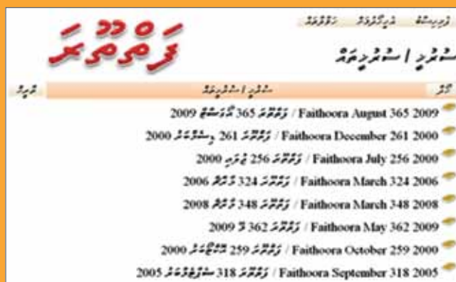
Figure 2: “Title” view of the Digital Library which displays all the titles in the library (displayed in the English language interface)

At present, the digital library can be browsed by title and date as seen in Figure 2. It can be searched based on the title of the articles as seen in Figure 3. While full text is available, it is not searchable at present due to issues with optical character recognition of Dhivehi script on scanned documents. This enhancement is marked as the next phase of the MNU Library’s DL project for Faithoora. The creation of this collection has facilitated in the creation of other much needed Digital Library collections of local material.