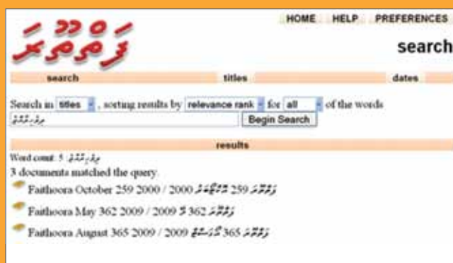
Figure 3: Search result for the term “dhivehiraajje” (Maldives) – (displayed in the Dhivehi (local) language interface)