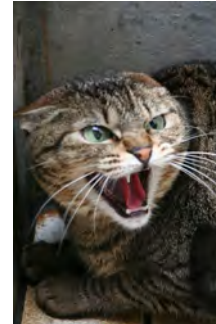
An aggressive cat

Rabies is a fatal disease and there is one Human death due to Rabies every 10 minutes. Rabies claims more than 55,000 deaths in Asia and Africa.