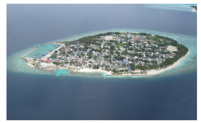
Figure 1: Maldivian islands