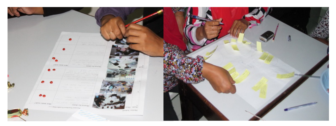
Figure 4: The World Café activities: Photo and graphic elicitation activities

Fourteen teachers participated in the intervention phase of the study: 7 CFS class teachers (Grades 1-4); and 7 primary subject teachers (Grades 5-7). Multiple data collection methods, which included questionnaires, classroom observations, semi-structured interviews and teacher reflection booklets, were used during the intervention phase with the two groups of teachers. Table 2 (below) gives an overview of participants and data collection tools for the two study phases. Further data sources included my field notes, which was a log of activities, daily reflections, and notes from meetings (both planned and incidental) within the school.