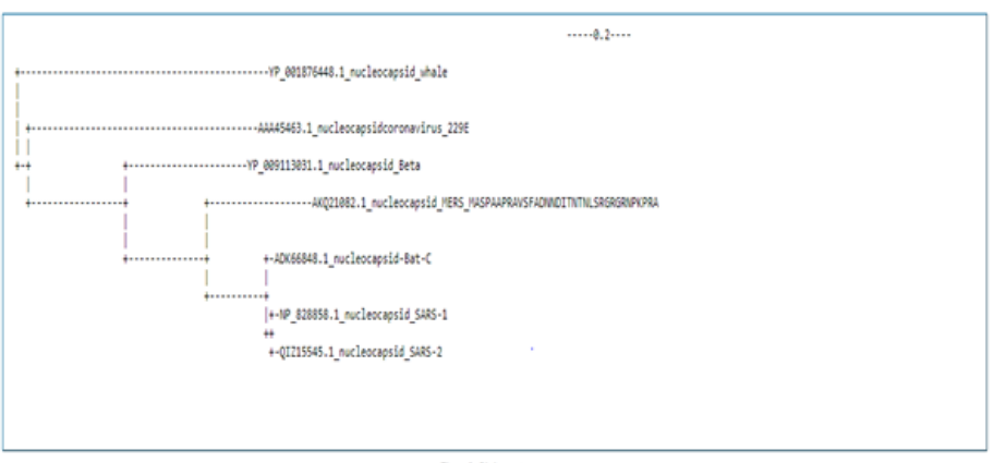
Figure 1: Phylogenetic tree

have less genetic homology. Branching patterns of the phylogenetic tree (figure -3) clearly shows that SARS-CoV-2 and SARS-CoV-1 rise from single genetic lineage whereas MERS-CoV has a different lineage. (Figure -3)