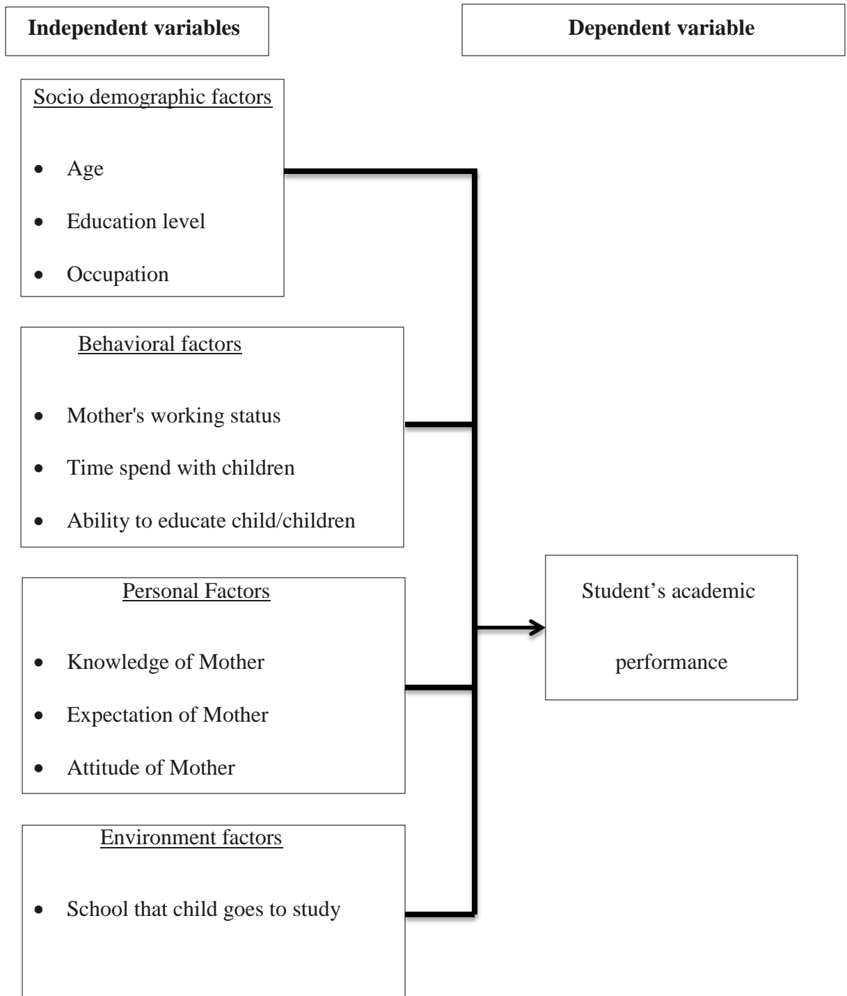
Figure 2.2: Theoretical framework of the study.